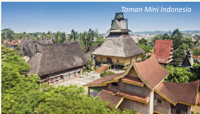
Taman Mini Indonesia

on the beaches, exploring caves or snorkeling with the colorful fish and abundant sea life.