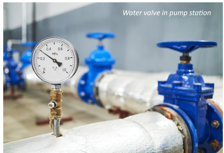
Water valve in pump station